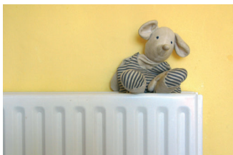
Broken boilers are no fun

No one wants to go without heating and hot water in the winter, so it makes sense to plan the replacement of your boiler rather than waiting for it to break down. It also means that you can take your time to shop around for quotes rather than having to get an emergency replacement in a rush. And remember, heating engineers tend to be busier in the winter so if your boiler breaks down then, you may have a long wait before someone can come to your home to install a new one.