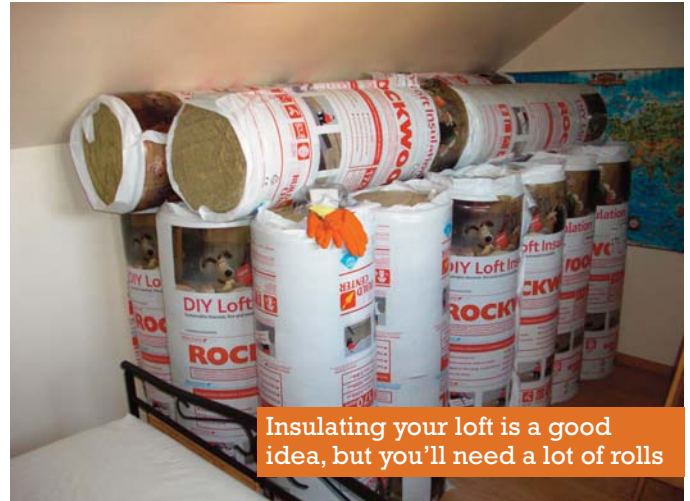
Insulating your loft is a good idea, but you'll need a lot of rolls

You'll need to know how many rolls to buy – most retailers and manufacturers can calculate this for you if you provide a few details. First, measure the floor area of your loft. In most properties you can do this using the length and width of the rooms beneath. If you already have some old insulation in place, measure the depth so you know how much of a top-up you need. Using mineral fibre, the