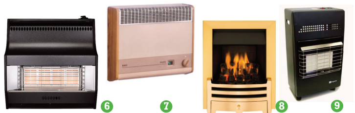
Hot parade (gas) 6) radiant gas fire, 7) gas convector heater, 8) open gas fire, 9) bottled gas fire

These include traditional gas fires (6), convector heaters (7), open gas fires (8) and bottled-gas heaters (9). All can be run on mains gas or liquid petroleum gas (LPG). Bottled gas heaters, gas convector heaters and paraffin stoves don't need flues (chimneys). However, the water vapour they produce can cause condensation which will lead to damp and mould problems if the room is poorly ventilated.