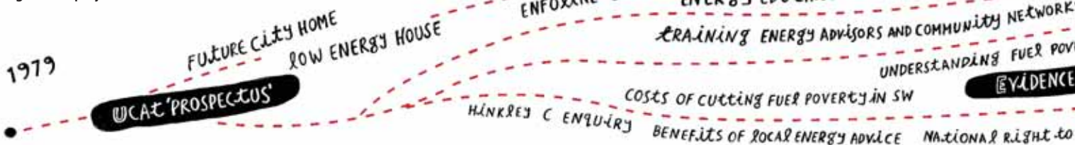
This is when we were founded as the Urban Centre for Appropriate Technology...

This illustration comes from our book, 'Switched on since 1979'. It shows how we've developed over the past 30 years and lists many of our most significant projects.