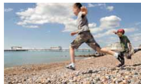
Worthing (above) is one of the West Sussex councils that has commissioned a study from CSE. Below, the city of Bristol (left) and a map (right) showing the council's electricity use in buildings such as schools, administration offices and libraries.