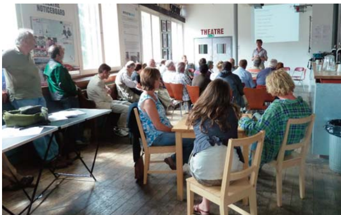
CSE community training on solar PV in Bristol, 2011

CSE is a leading expert in community-led sustainable energy and low carbon planning. We have extensive experience of working with community groups, local authorities and other organisations on energy issues.